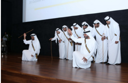
▲ Traditional Emirati dancers opened the UAE eHealth Week 2016