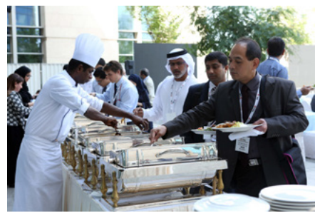
▲ Attendees enjoying the outdoor garden lunch